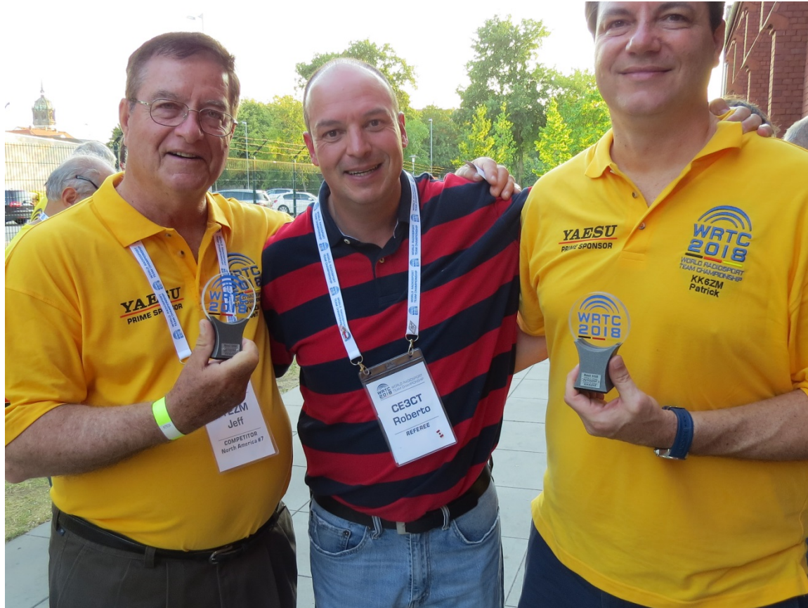
Team Y87B with SSB Awards