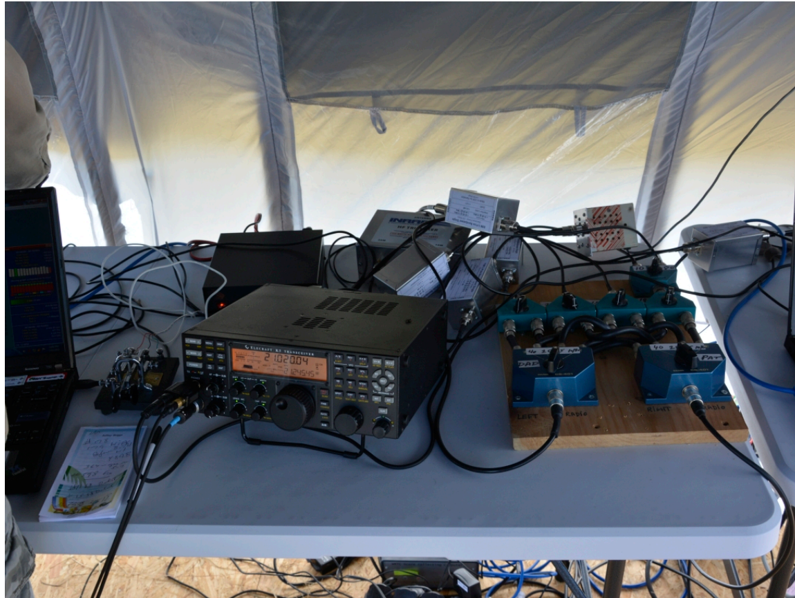
VY2ZM Side of Op Position