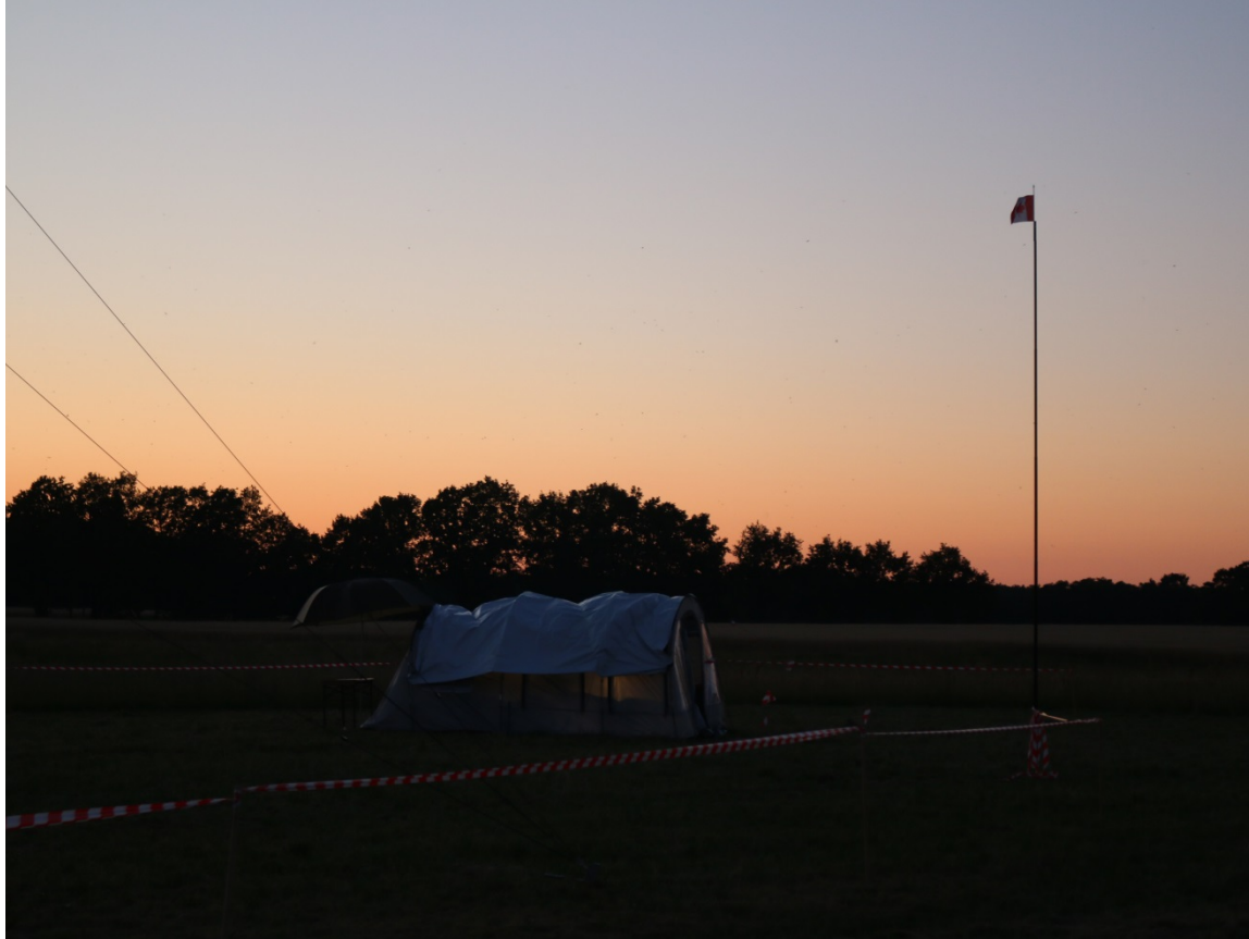
Operating Tent & VE Flag