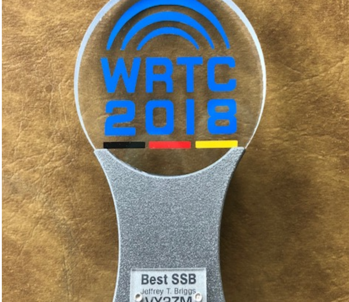
A Closeup of our SSB Award