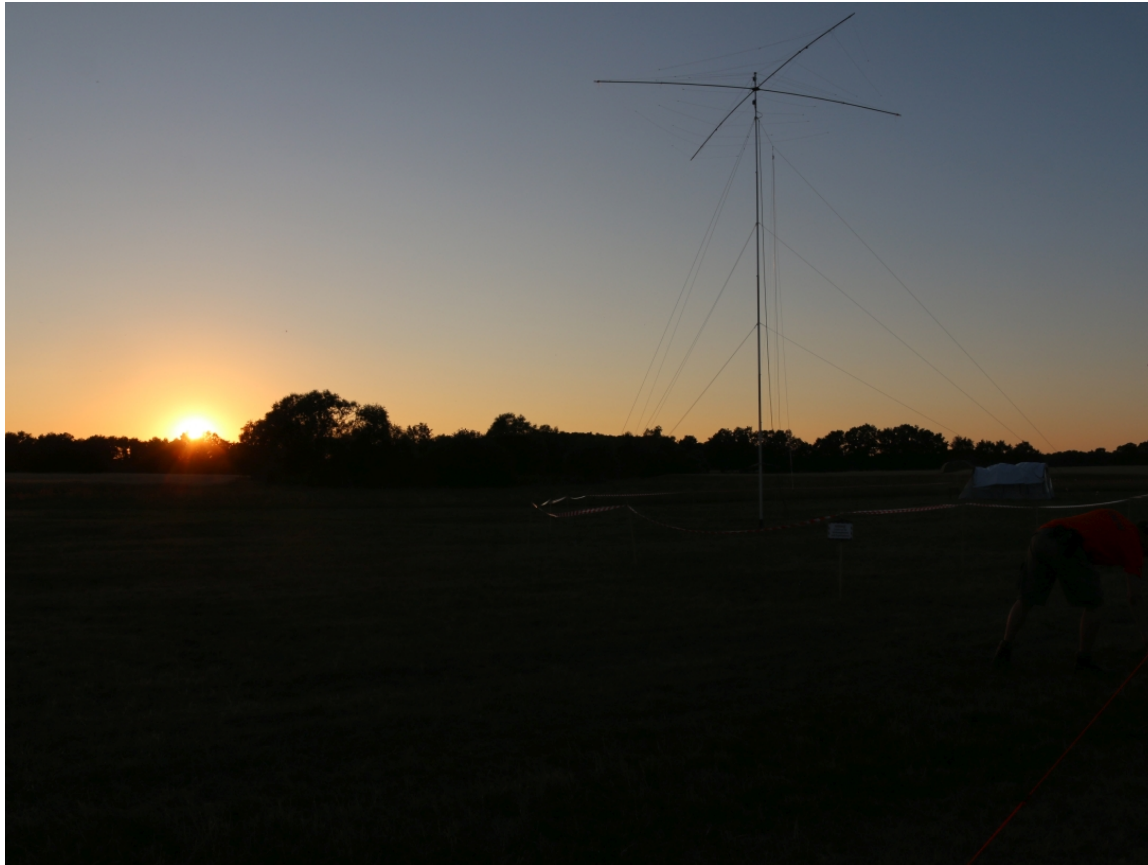
Sunset Over Y87B Sat Night